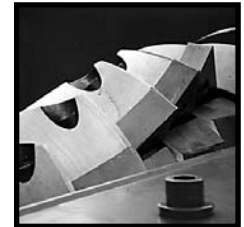
Easy and quick replacement of knives.