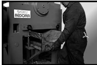
Quick replacement of screen.