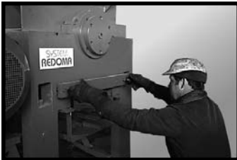
Special device for replacement of screen.

With reservation for technical alterations.