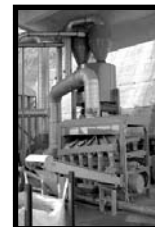
With surge bin and dust extraction system.