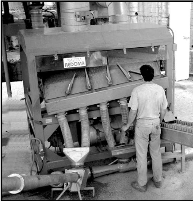
The Separator "Eagle" – separating the useful from the useless.