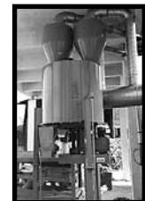
Surge bin with variable speed screw conveyor.